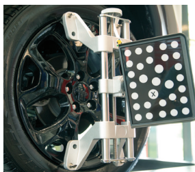
AC200 clamp (optional) (EAK0350J80A)