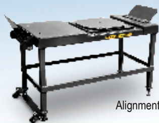
Alignment Stand (RB24)