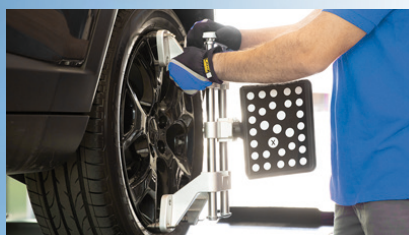
AC200 CLAMPS EAK0350J80A