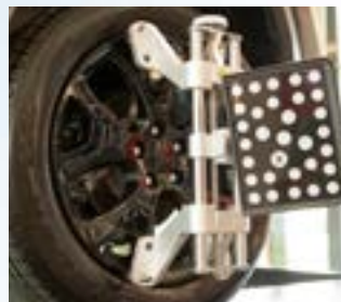
AC200 clamps (EAK0350J80A)