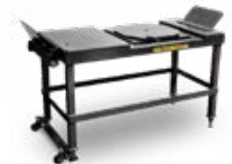
Alignment Stand (RB24)