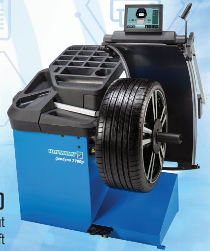
7700 Version without wheel lift

Engineered for optimal performance, this feature intelligently adjusts the number of revolutions according to each wheel's specifications. Operating at maximum speed, it effectively reduces cycle time, delivering swift and efficient results.