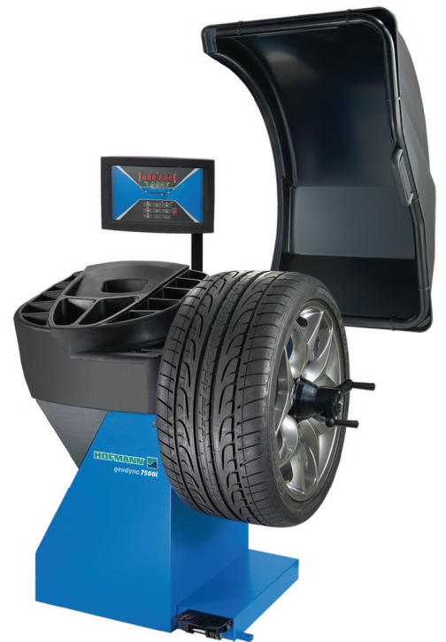
7500L Version with Quick Nut instead of Power Clamp™